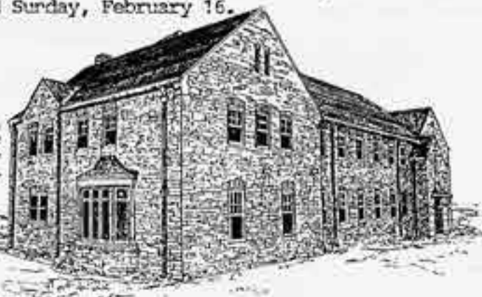
Wisconsin Industrial School for Girls Fitchburg

In addition to our guest speakers, we will hold our annual business meeting which includes elections to the Board of Directors and renewal of memberships. Special refreshments are planned as well. Please plan to attend Sunday, February 16.